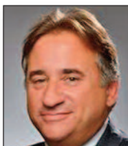
Councilman Jim Shulman, Nashville Metropolitan Council