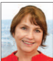
Judge Patricia Cottrell Tennessee Court of Appeals Judge