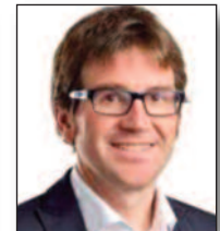
Gorka Urtaran, Mayor of Vitoria-Gasteiz, Basque Country