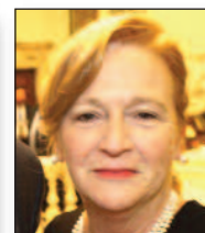
Judge Francine Schott, New Jersey