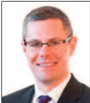
Derek Mackay MSP Cabinet Secretary for Finance and Constitution